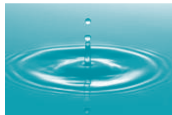
2011 SUNSHINE IN ORDINARY TIME